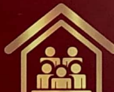
10-ROOM GUEST HOUSE