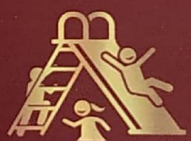
KIDS PLAY ZONE