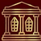
MULTI PURPOSE HALL/ BALLROOM-3000 sq. ft.