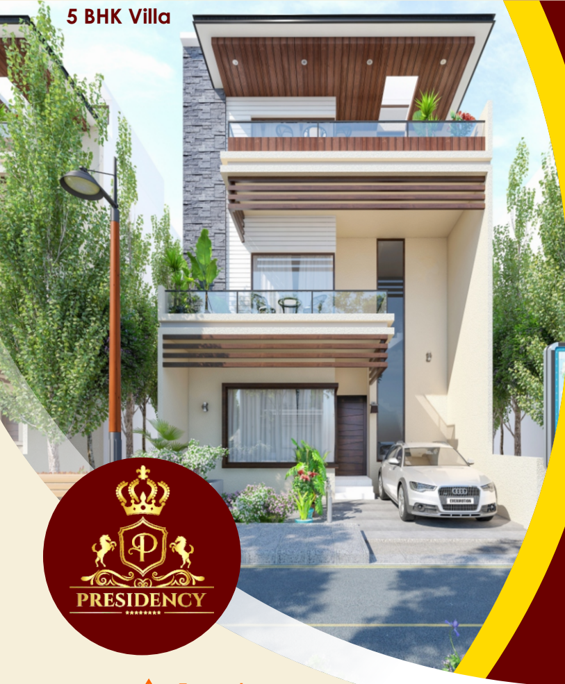
5 BHK Villa

PLOTS with MDDA approved 5 BHK House Map